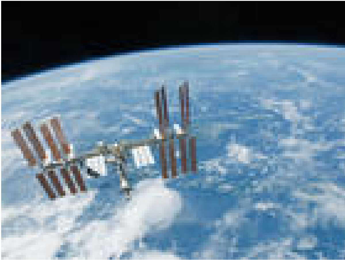
Exomedicine arrives: How labs in space could pave the way for healthcare breakthroughs on Earth