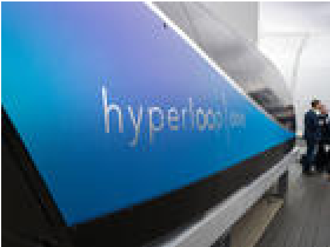
The new commute: How driverless cars, hyperloop, and drones will change our travel plans