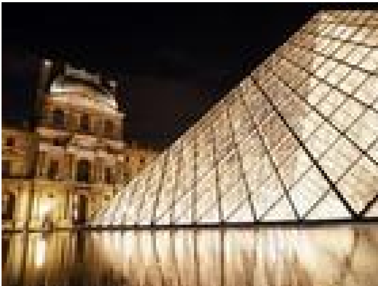
Startup Republic: How France reinvented itself for the 21st century by wooing entrepreneurs to Paris